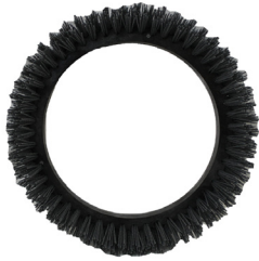
12" NyloGrit Brush .040" O-237056