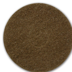
12" Strip Pad, Brown O-437-049