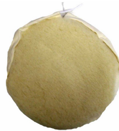
12" Lambs Wool Bonnet O-437-054