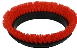
12" Orange Scrub Brush .028" O-237-047