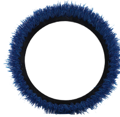
12" Blue Scrub Brush .020" O-237058