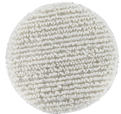
12" Carpet Bonnet O-437053