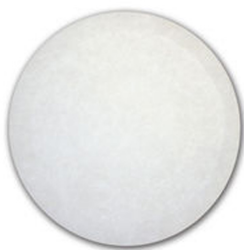
12" Polish Pad, White O-437-051