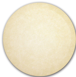
12" Beige Stone Care O-437058